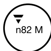
HGZ 330 pF to 2.2 nF