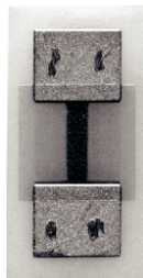
Product may not be to scale

The CC1- series single-value resistor chips offer a small size, low shunt capacitance and solder pad option. The CC1- nichrome resistors material offers excellent stability. The CC1- resistors are manufactured using Vishay Electro-Films (EFI) sophisticated thin film equipment and manufacturing technology. The CC1- resistors are 100 % electrically tested and visually inspected to MIL-STD-883.