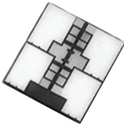
Product may not be to scale