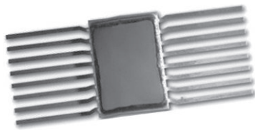
Product may not be to scale