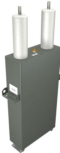
Mechanically suitable for horizontal arrangement