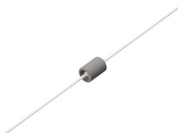
Axial wire lead for series 5FC, 5FD, and 5FE