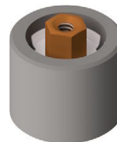
Screw terminal with hexagon (metric and UNF/UNC thread available) for series 5FAE, 7FAA, and 7FAU