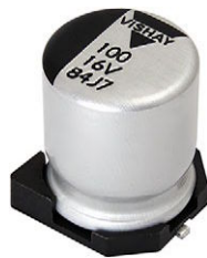
4 mm x 5.5 mm to 10 mm x 13 mm