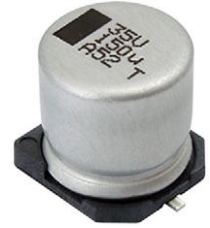
4 mm x 5.3 mm to 18 mm x 21 mm