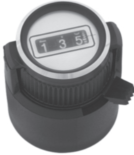
23-1-21 Projecting L. 31.5 mm