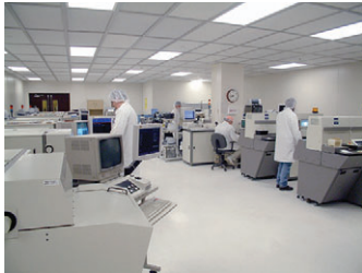
100 % Electrical Test

Vishay EFI part numbers with the pack code "ST" are sold as a full 3" or 5" wafers that have been diced into individual die. The parts are supplied as a sawn wafer on a tape ring (see picture below).