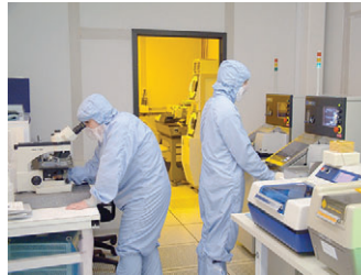
Dice Into Individual Die