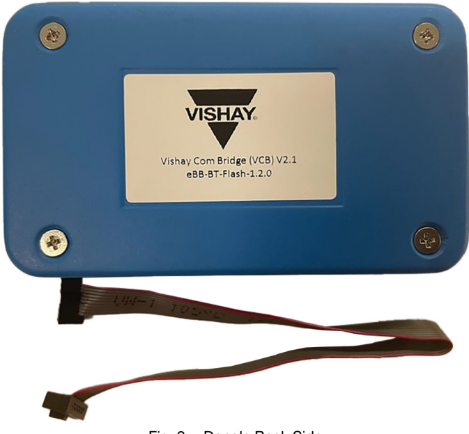
Fig. 2 - Dongle Back Side

1 For technical questions, contact: <u>powerictechsupport@vishay.com</u>