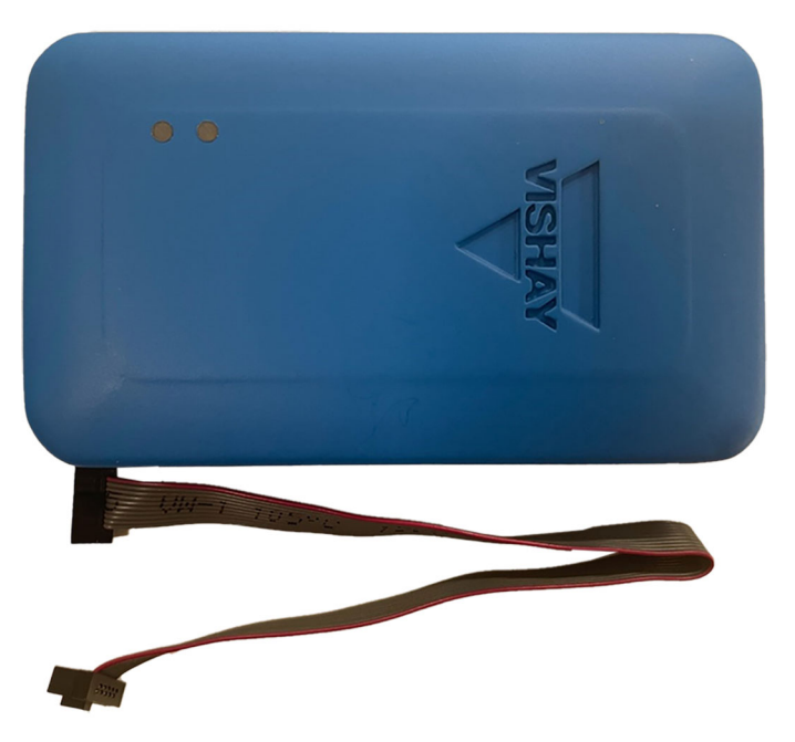
Fig. 1 - Dongle Front Side

The Vishay communication dongle is used as an interface between a computer and a PMBUS enabled device (potentially a device with other communication protocol in the future). The dongle board and cable are shown in Fig. 1 and Fig. 2.