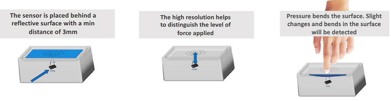
Fig. 4 - Add Caption Here, Same as Narration in the Video for These Images

Using an I<sup>2</sup>C interface, there are several programmable features of Vishay's digital proximity sensors that make them ideal for this application. The emitter current is programmable. Initial design work can establish the optimal emitter current for the screen location. If calibration is required during the manufacturing process, the emitter current can be easily adjusted from 5 mA to 20 mA in 2.5 mA steps. In proximity applications the emitter is pulsed, and Vishay's sensors offer four different duty cycles that can be programmed from 1:40 to 1:160 on / off cycles. The sensors feature 16-bit resolution which is needed to be able to measure the small deflections in the capacitive touch screen. They have a sunlight canceling feature, allowing the sensor to function in most any ambient lighting environment. Finally, the sensors allow programmable thresholds that trigger an interrupt signal when exceeded. This eliminate the need for the microcontroller to be constantly polling the sensor.