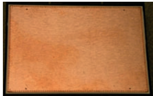
Fig. 1 - Example of Discoloration

The mounting surface of AAP module must be with no particles. Discolorations or polished copper layer can be present as results of overall assembly process of the device; they do not have impact on thermal dissipation and on device performances in final applications therefore are considered just as cosmetic imperfection (see below figures as examples).