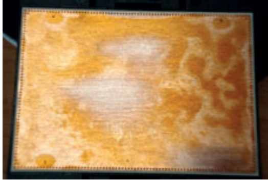
Fig. 2 - Example of Discoloration