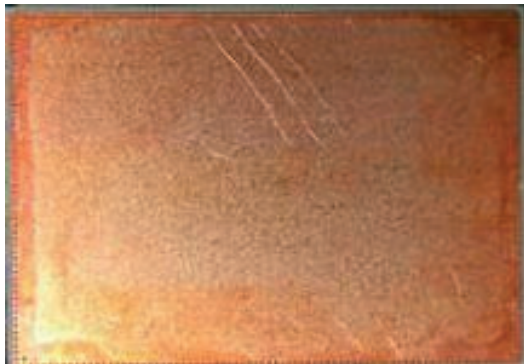
Fig. 4 - Example of Scratch

Slightly scratch also do not have impact on thermal dissipation and on device performances (Fig. 4 as example).