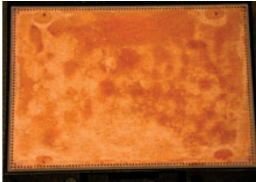
Fig. 3 - Example of Discoloration

Slightly scratch also do not have impact on thermal dissipation and on device performances (Fig. 4 as example).