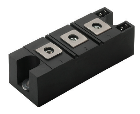
Fig. 1 - Example of a IAP Module

IAP modules are designed to provide reliable performance. A single housing is used to integrate power components, providing higher power density. Various die selections are available in several configurations.