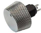
Custom Metal Knob on the P16F Model