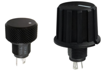
P16, PA16 P16S, PA16S

Vishay's P16 series knob potentiometers are now available with a double detent option that provides positive tactile feedback in both the counter-clockwise (CCW) and clockwise (CW) positions. The lifespan has also been upgraded to 200k cycles. Combined with the original P16 potentiometer, the series now offers a complete range of long life devices. With their full IP67 sealing, the potentiometers deliver reliable operation in extreme environmental conditions where sustainability and compact footprints are required.